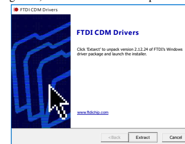
Figure 2 FTDI CDM Drivers interface