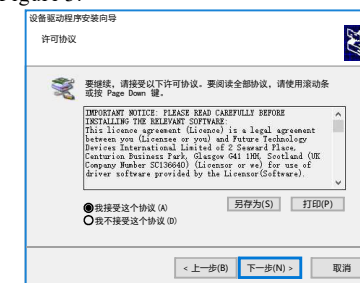
Figure 3 License agreement interface